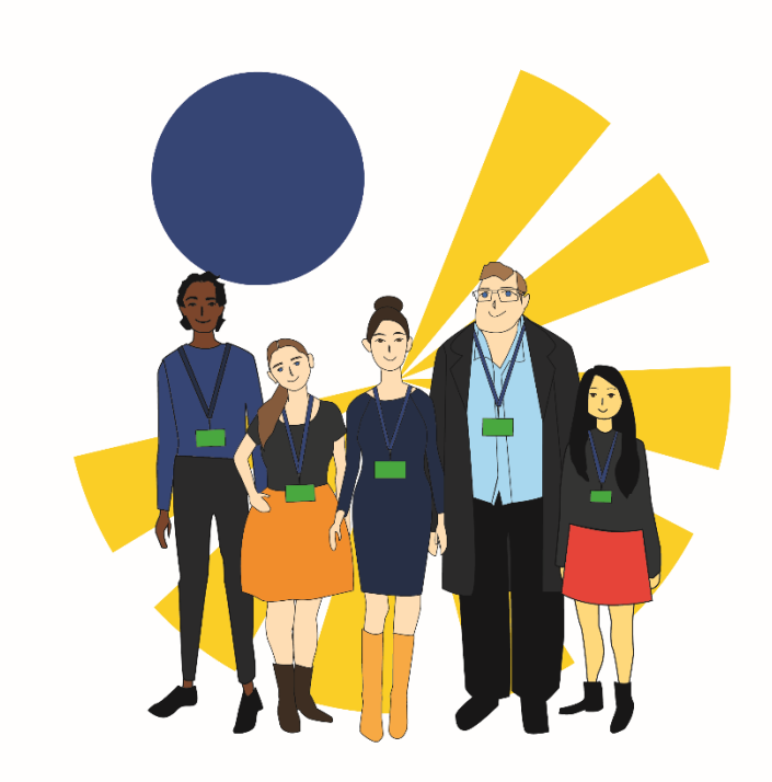
Debaters Association of Victoria

480 Collins St, Melbourne 3000 Phone (03) 9348 9477 ABN 36 529 609 712